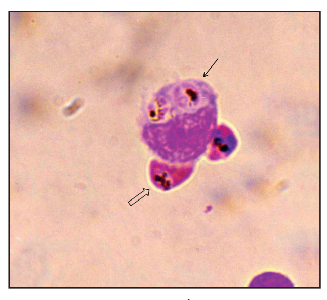
A trophozoite of Plasmodium falciparum (arrow), observed within the phagosome of a monocyte. Giemsa staining, 1,000x magnification.

Our present investigation adds further information on the process of phagocytosis of Plasmodium falciparum infected erythrocytes by human monocytes. We showed that